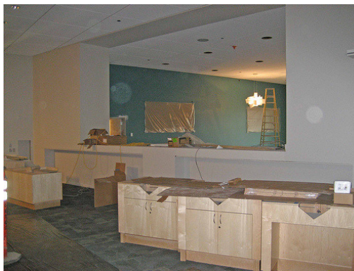
Photo of the Mastodon case under construction.