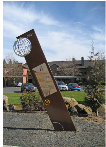
Tualatin's new Meridian Marker

Park at Browns Ferry Park and use the pathway to reach the marker. Signs and volunteers will guide the way.